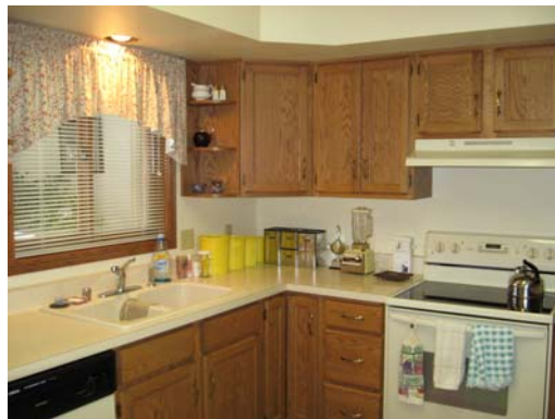
Large kitchen with seating area