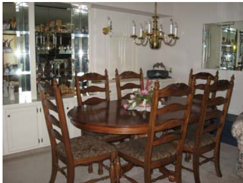
Dining area with built-in cabinetry