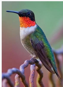
Ruby Throated Hummingbird