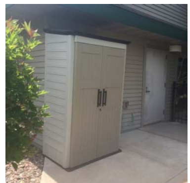
Fishing Equipment Storage Shed

Yes, a Fishing Equipment Storage Shed is conveniently located to the south of the Creekview Café entrance in the Household 7 courtyard.