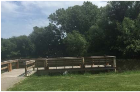
Evergreen Fishing Dock